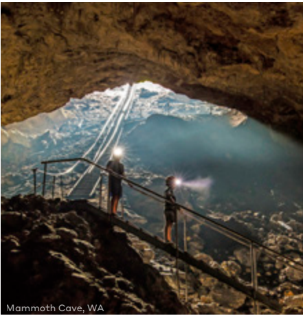
Mammoth Cave, WA

Wake this morning to take in the full spectacle of the Blue Mountains on Sydney's doorstep. After your arrival into Katoomba, select from a choice of mountain experiences before completing your epic transcontinental crossing at Sydney's Central Station. (B,L)