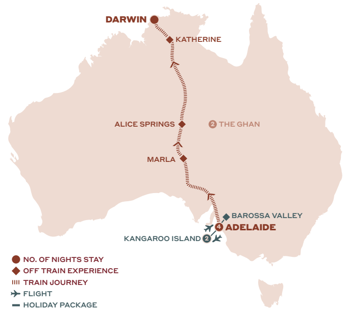
NO. OF NIGHTS STAY OFF TRAIN EXPERIENCE TRAIN JOURNEY FLIGHT HOLIDAY PACKAGE