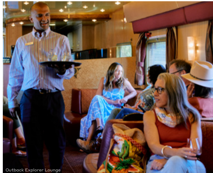
Outback Explorer Lounge

Gold includes hearty breakfasts, two-course lunches and three-course dinners. You may also choose to complement your meal with our selection of wines and beverages, all included in your fare.