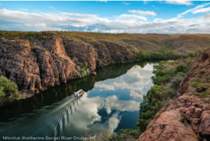
Nitmiluk (Katherine Gorge) River Cruise, NT

Day 3: Katherine and Darwin Your final day dawns in the tropical north. In Katherine, cruise Nitmiluk Gorge or learn more about Indigenous rock paintings and culture on your selected Off Train Experience. You'll be awed by the towering sandstone cliffs and calm waters flowing through this ancient carved waterway. (As evening falls, arrive in Darwin to complete your epic northbound journey. (B,L)