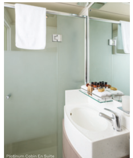
Platinum Cabin En Suite