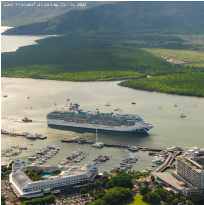
Coral Princess® cruise ship, Cairns, QLD