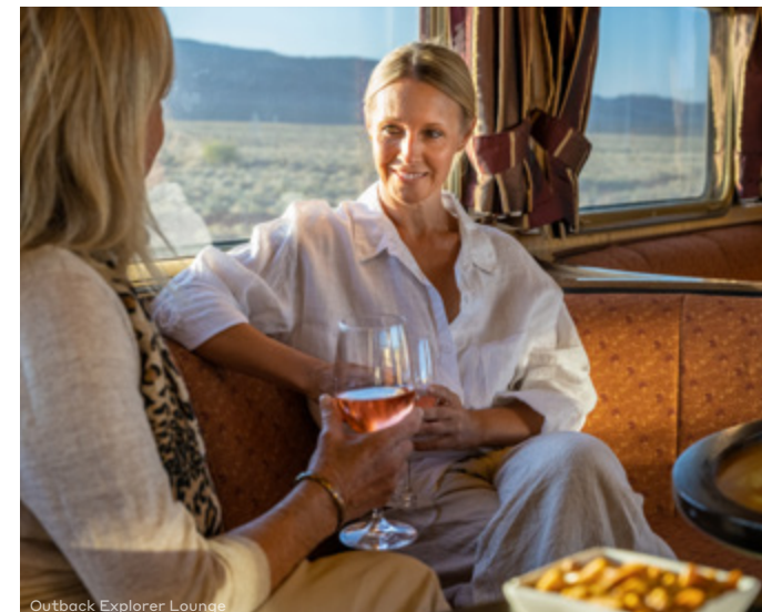
Outback Explorer Lounge