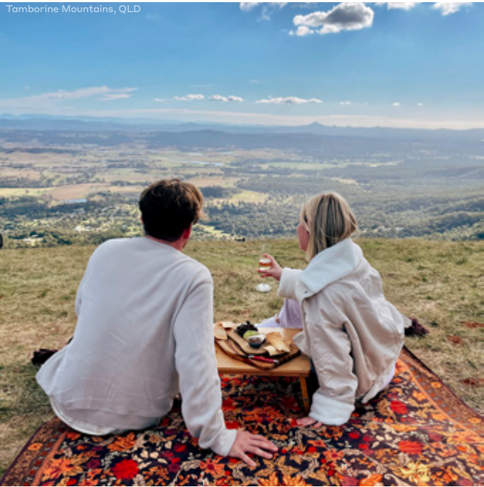
Tamborine Mountains, QLD