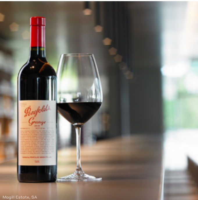
Magill Estate, SA