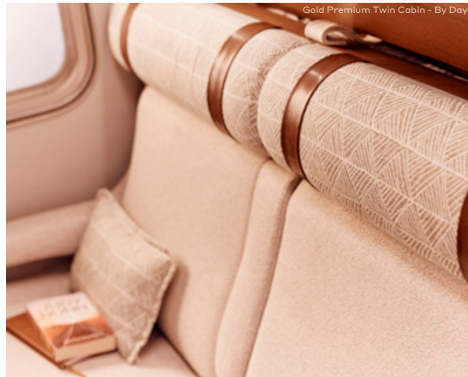
Gold Premium Twin Cabin - By Day

Gold Premium cabins have a compact ensuite with a toilet, washbasin and shower, and you can choose from six in-cabin music and journey commentary channels to add ambience to your travels – or enjoy the hum of the train as the soundtrack to your journey.