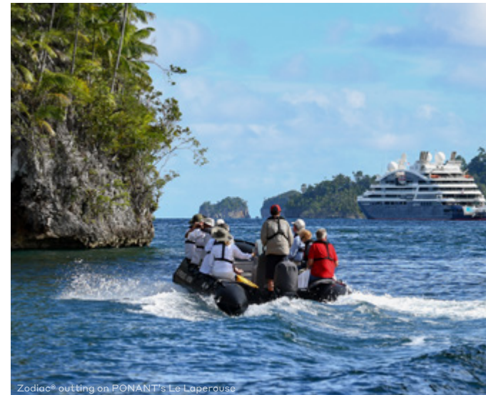
Zodiac® outing on PONANT's Le Lapereuse