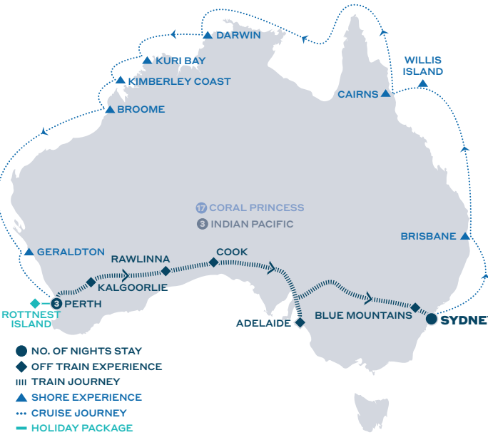
Onboard the Coral Princess® cruise ship