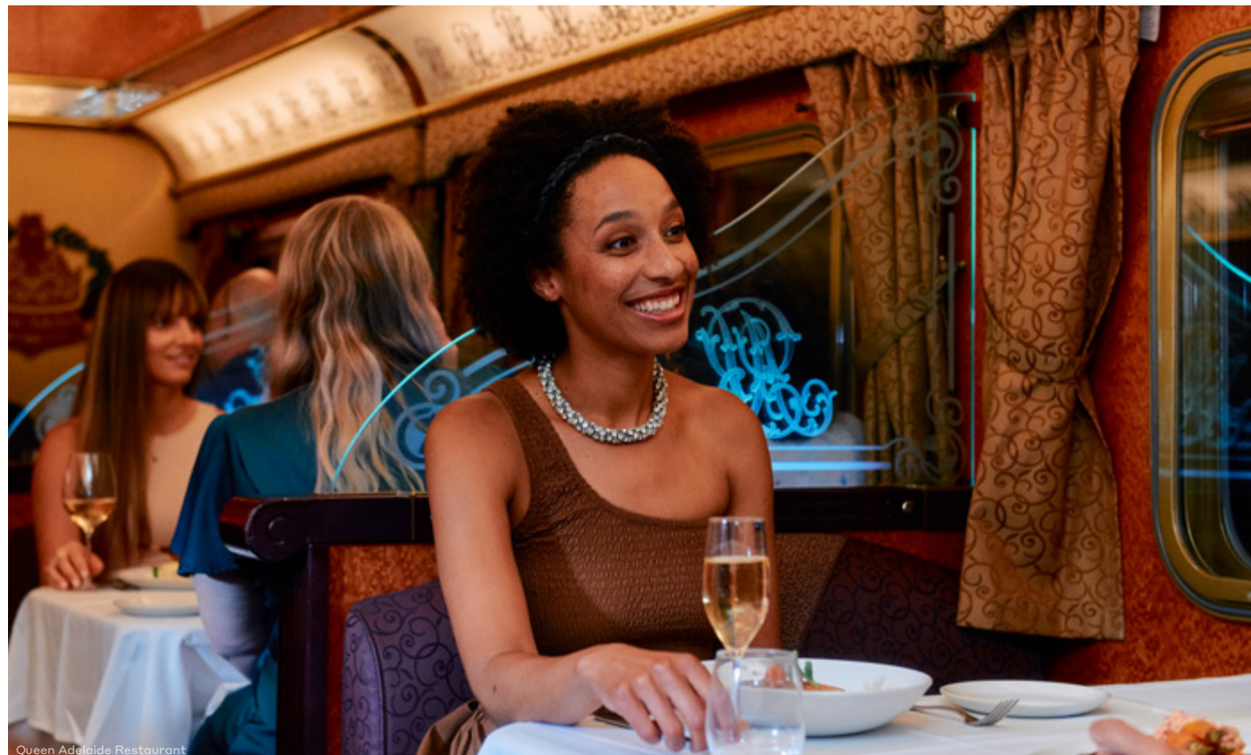
Queen Adelaide Restaurant