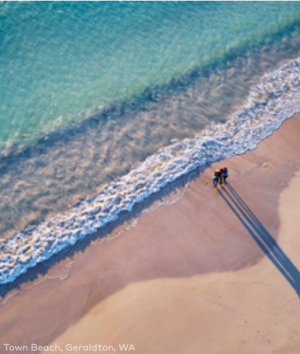
Town Beach, Geraldton, WA

Explore the World Heritage-listed Blue Mountains on an Off Train Experience, taking in ancient forests, sheer cliffs and incredible views. Continue your journey to Sydney Central Station, where your cross-country adventure concludes. (B,L)