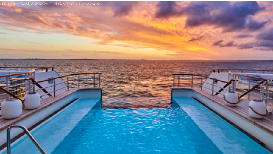
Outdoor pool, onboard PONANT's Le Laperouse

Jar Island contains ancient rock art galleries depicting the Gwion Gwion style, unique to the region, representing the first wave of seagoing colonisers of the Australian continent. These are the oldest detailed depictions of human figures in the world. Join your Expedition Team for a walk past some fascinating rock formations to the site of the Gwion Gwion art galleries. (B,L,D)