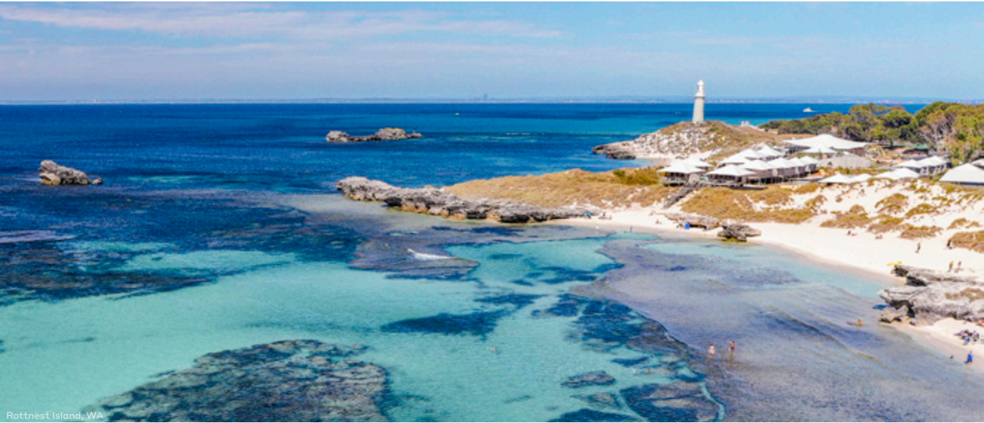
Rottnest Island, WA