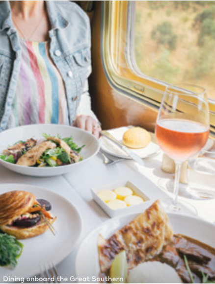
Dining onboard the Great Southern