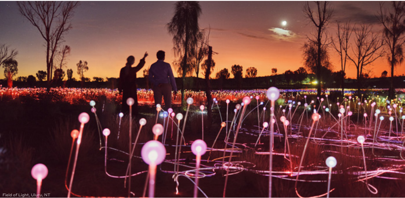
Field of Light, Uluru, NT