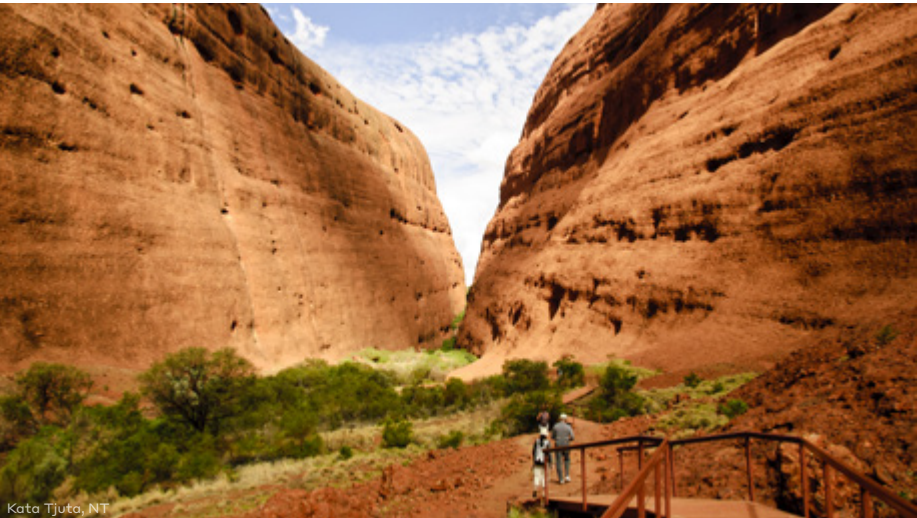
Kata Tjuta, NT

The highlight today is the World Heritage Ubirr art site, home to some of the world's most outstanding rock art. Those feeling fit can climb to the top of the escarpment for a magnificent view across the floodplain. Next up, take an Indigenous cultural cruise on the East Alligator River. Hear the stories of the region as you spot the large crocodiles that dwell in these waters. Returning to our sturdy vehicle, we'll traverse Cahill's