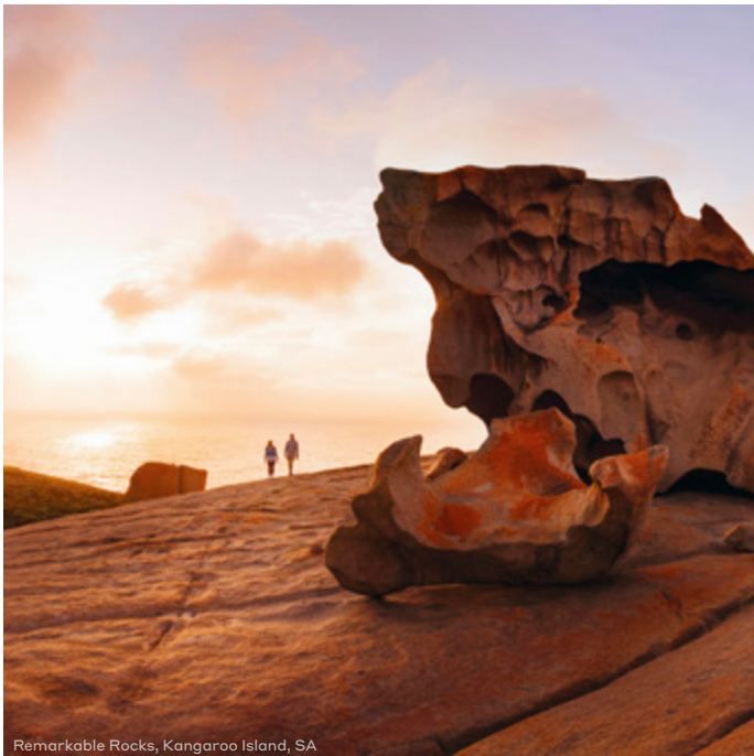
Remarkable Rocks, Kangaroo Island, SA