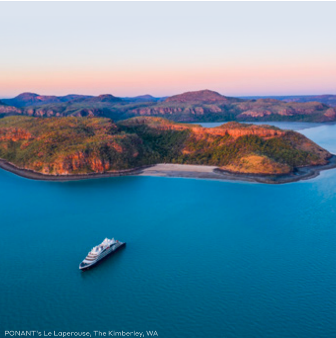
PONANT's Le Laperouse, The Kimberley, WA