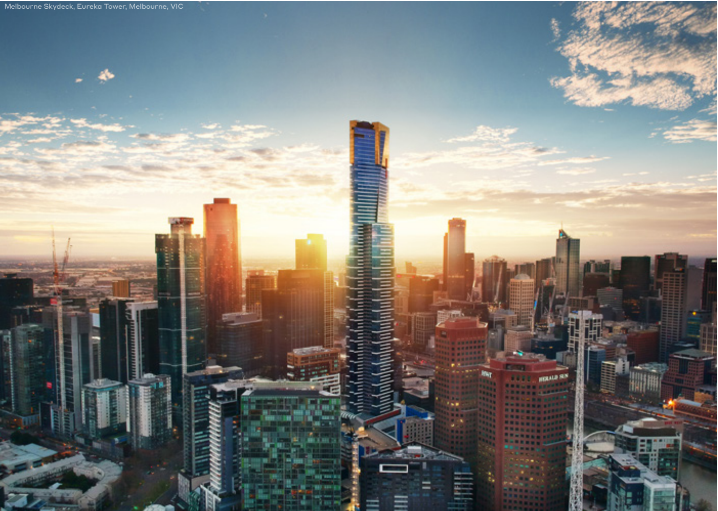
Melbourne Skydeck, Eureka Tower, Melbourne, VIC

Standing proud at 300 metres tall, it’s hard to miss Melbourne’s gold-plated Eureka Tower. Melbourne Skydeck at Eureka Tower has been transformed, revamped, and innovated from the ground floor all the way up to level 88. Renowned for its unparalleled views of Melbourne, Skydeck is now home to a brand new multi-sensory interactive experience that defies expectations. The impressive Voyager Theatre and augmented reality windows will have you experiencing a whole new side to the city we love. It’s Melbourne on another level.