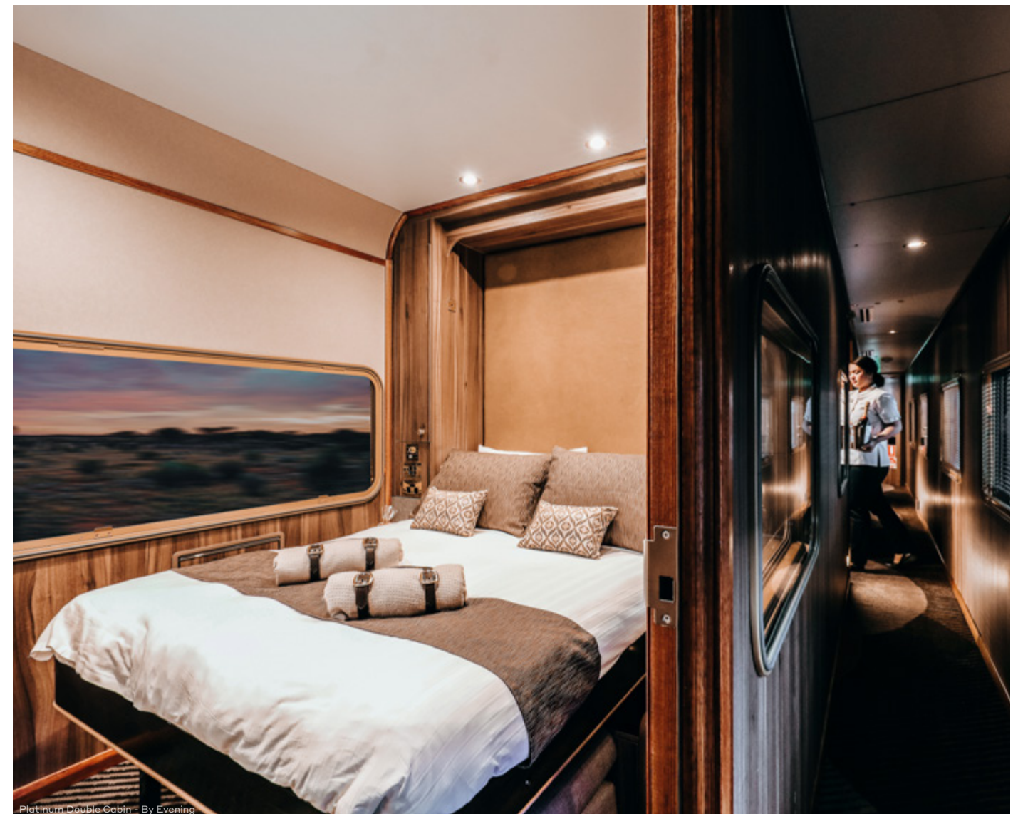
Platinum Double Cabin - By Evening