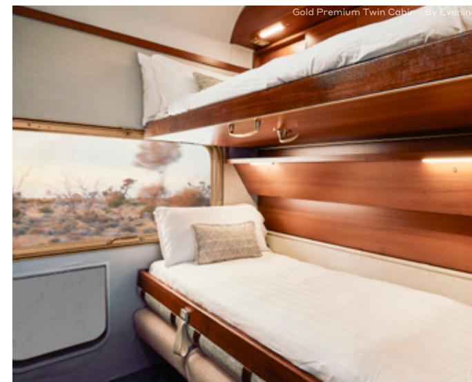
Gold Premium Twin Cabin - By Evening