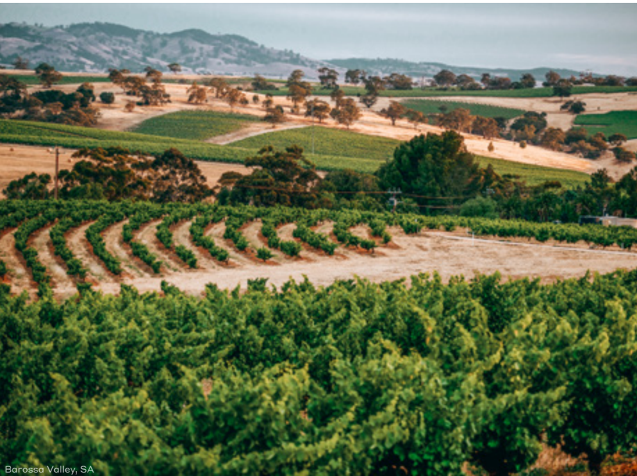
Barossa Valley, SA

The evening is free to explore some of Adelaide's many dining and entertainment precincts. (B) 3 nights, Sofitel Adelaide.