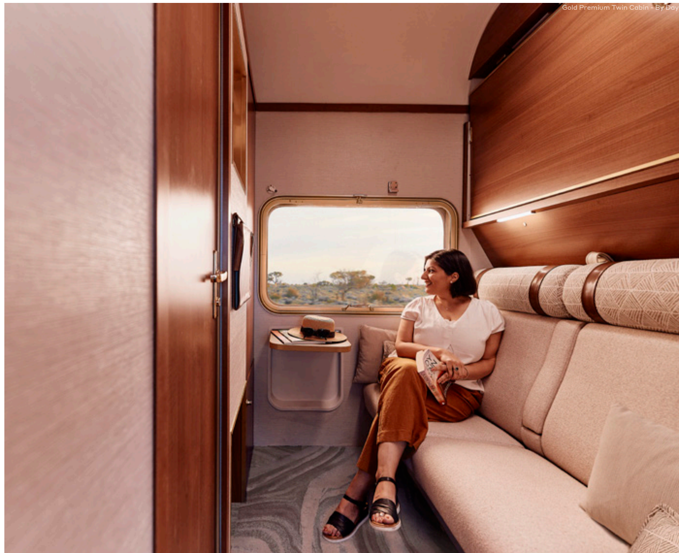
Gold Premium Twin Cabin - By Day

Gold Premium Dining is a feast in multiple ways, with a contemporary design that respects Art Deco as the setting for carefully curated meals, from hearty breakfasts to two-course regionally inspired lunches and delectable four-course dinners, featuring the finest ingredients from local suppliers, farmers and providers. Naturally, this is accompanied by a selection of premium Australian wines.