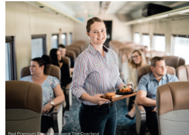
Red Premium Service onboard The Overland