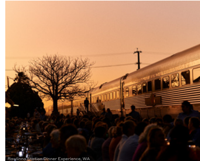
Rawlinna Station Dinner Experience, WA