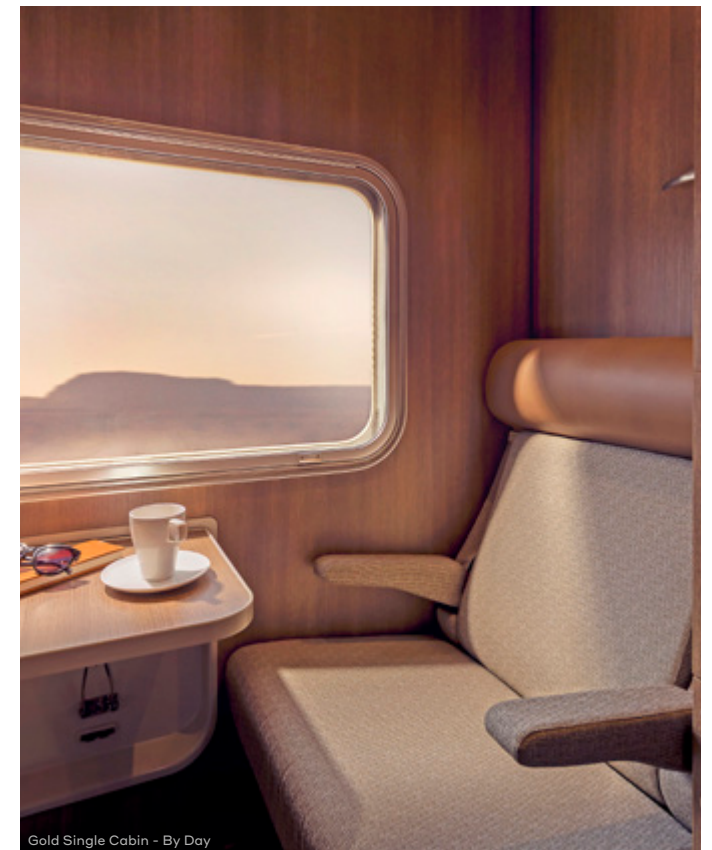
Gold Single Cabin - By Day

Our Gold Single is a comfortable sleeper cabin option for one. A comfortable couch seat with full leg extension by day converts to a cosy bed by night to ensure a restful sleep. Spacious shared bathroom facilities and your own complimentary, high-quality Australian-made toiletries are included. When the time comes for the soulful, reflective and contemplative nature of moving across the continent by train, the Gold Single cabin provides privacy for one. Your train crew will arrange seating options in the Queen Adelaide Restaurant to ensure you meet fellow travellers over delicious meals. The Outback Explorer Lounge is also a focal point for daily social interactions.