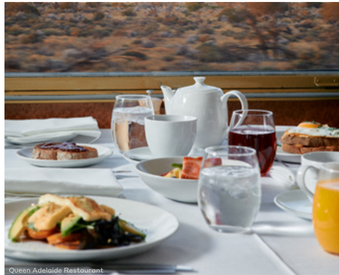
Queen Adelaide Restaurant