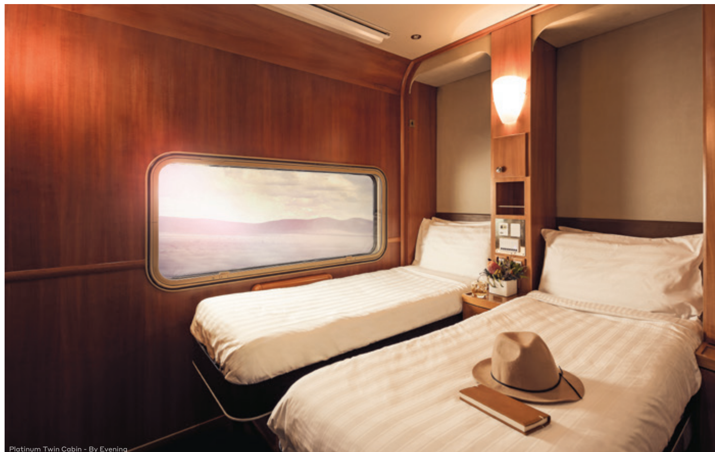
Platinum Twin Cabin - By Evening