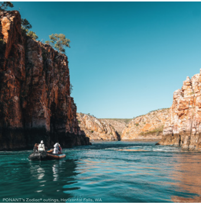
PONANT's Zodiac® outings, Horizontal Falls, WA