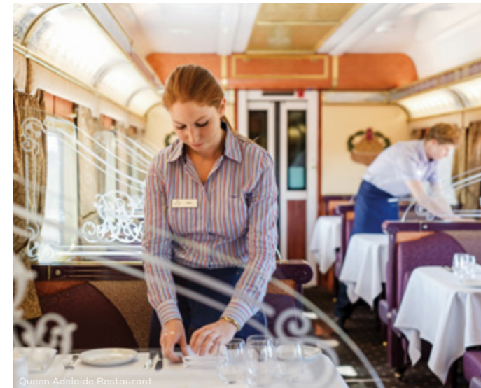
Queen Adelaide Restaurant