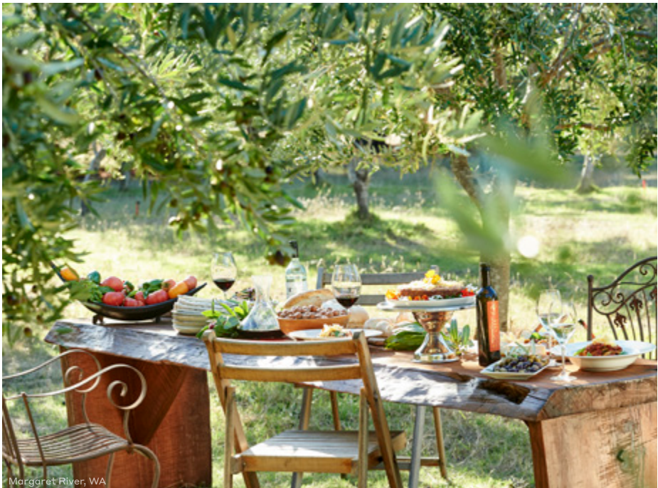
Margaret River, WA

After making your own way to Perth, settle in to your accommodation. 1 night, Parmelia Hilton Perth.