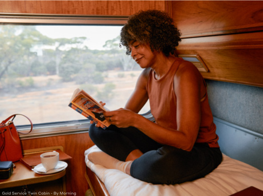
Gold Service Twin Cabin - By Morning