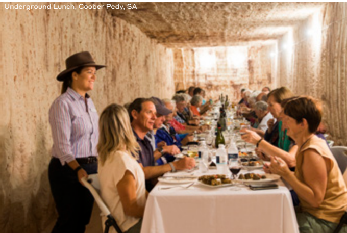
Underground Lunch, Coober Pedy, SA

Enjoy a leisurely brunch as you prepare for your arrival into Adelaide. (B)