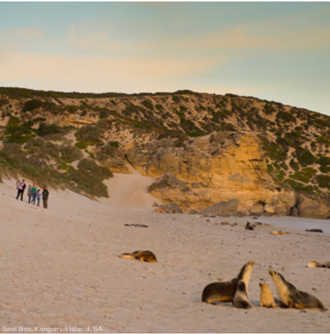
Seal Bay, Kangaroo Island, SA