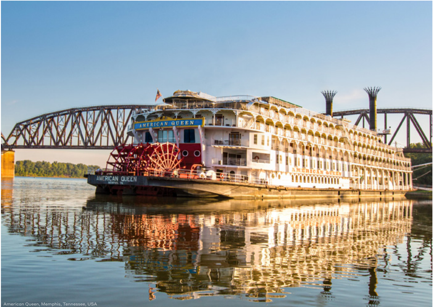
American Queen, Memphis, Tennessee, USA

Join us as we discover the sweeping vistas and intimate encounters of America’s great rivers, stunning lakes, and breathtaking coastlines.