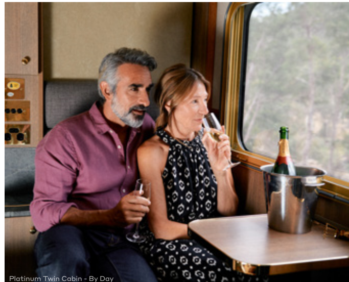
Platinum Twin Cabin - By Day

By day, your cabin is configured as a private lounge with deluxe seating, a table and two ottomans. By night, you'll be rocked to sleep as the cabin converts into a comfortable bedroom with either double or twin beds. It's the perfect place to relax and take in the amazing views sweeping past your panoramic windows. Or for a more social experience, head to the beautifully appointed Platinum Club, exclusive to Platinum guests. With a premium bar, lounge and flexible dining area, the Platinum Club sets the scene for relaxed daytime conversation or elegant dinners with existing or new-found friends.