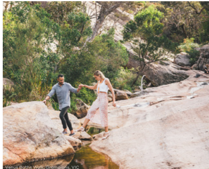
Venus Baths Walk, Grampians, VIC

In between tracing the landscape, each leg of our rail journeys are marked with tailored Off Train Experiences and authentic encounters. These experiences tell the unique story of the land, providing a sense of place, people, and culture.