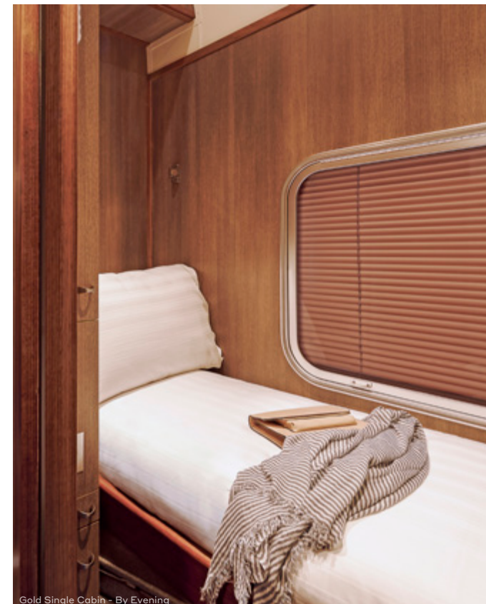
Gold Single Cabin - By Evening