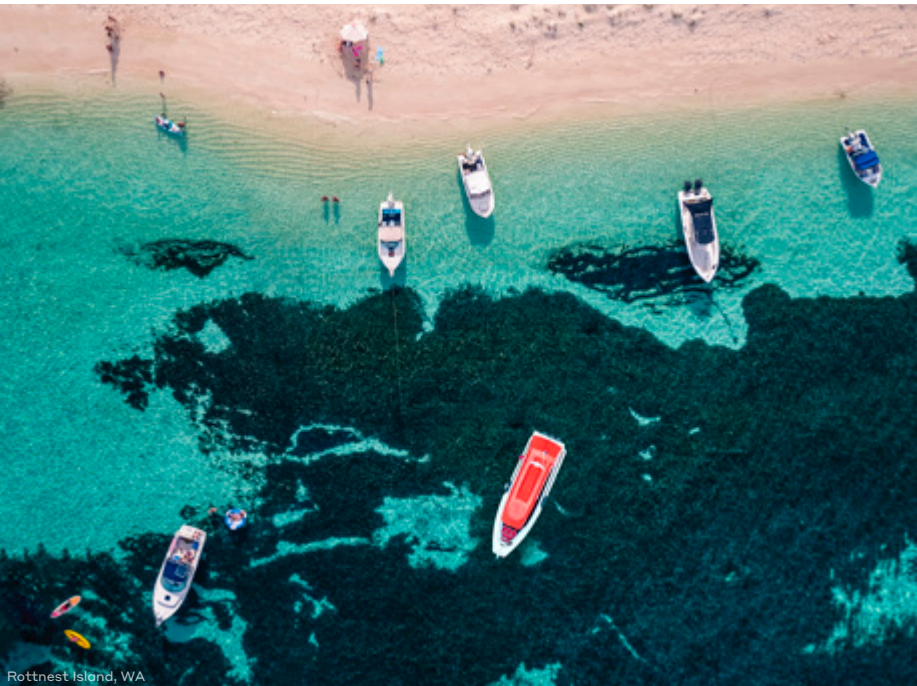
Rottnest Island, WA

After breakfast, check out of your accommodation. This signals the end of your epic journey across Australia. (B)