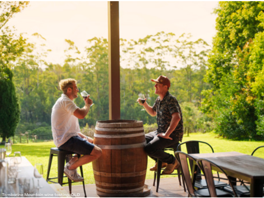
Tamborine Mountain wine tasting, QLD

Today, your gourmet escape sees you leave the city to experience Tamborine Mountain's unique food and wine trail, while absorbing spectacular views of rainforest and picturesque landscapes along the journey. Be guided through tastings at three boutique wineries and visit the Tamborine Mountain Distillery. This iconic institution is an award-winning manufacturer of a wide range of boutique liqueurs and spirits. The artisanal approach and multiple distillations, using a range of natural ingredients and native flora, creates smooth and unique flavours. You'll also enjoy a gourmet two-course winery lunch. (B,L)