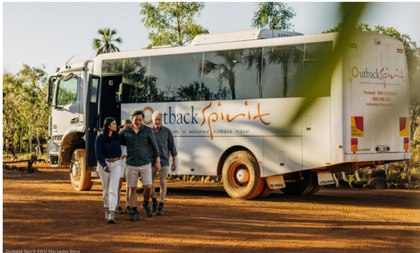
Outback Spirit 4WD Mercedes Benz

It's all about satiating your spirit of adventure, diving deep into the stories of the land and the places that few get to explore, and returning each evening to comfortable accommodation, eager to do it all again the next day. Combined with passionate and knowledgeable guides, every day is an enlightening experience. What better way to explore the centre of Australia than by travelling on The Ghan, disembarking midway and spending 7 days amidst the wonder before continuing your rail journey? Alternatively, extend your stay in the north, with three days to venture into Kakadu on an all-new small-group tour with Outback Spirit that ties neatly in with the start or end of your Ghan journey.