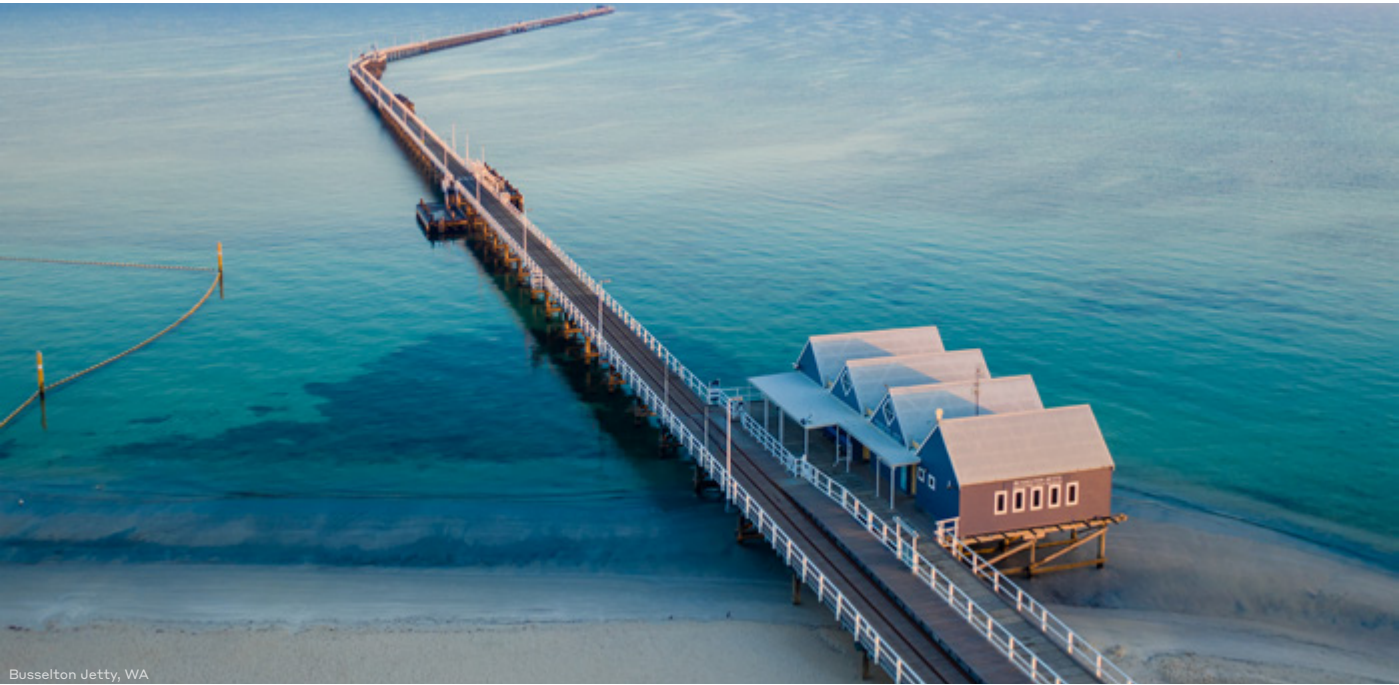
Busselton Jetty, WA