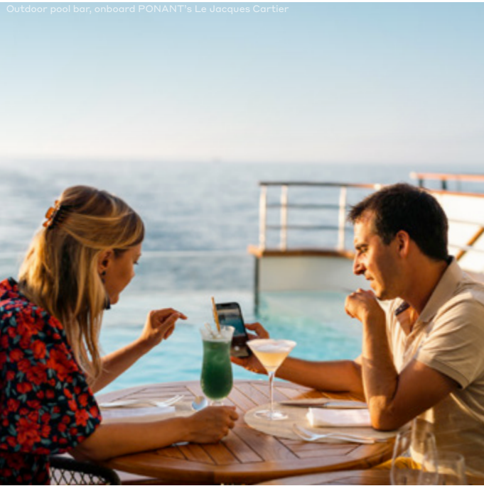
Outdoor pool bar, onboard PONANT's Le Jacques Cartier