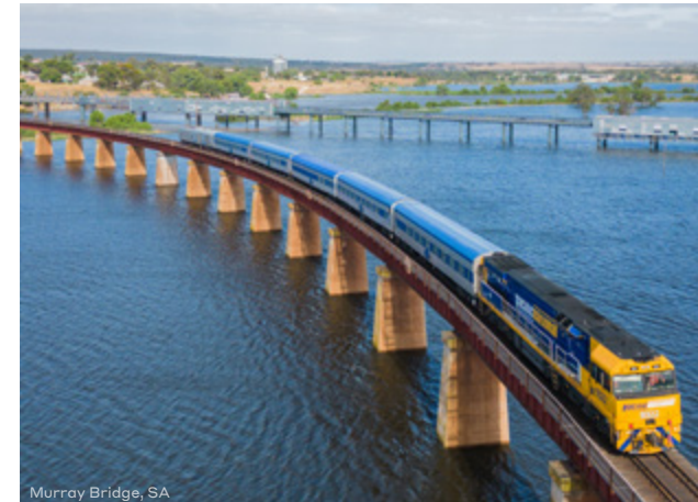
Murray Bridge, SA