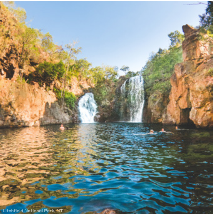
Litchfield National Park, NT