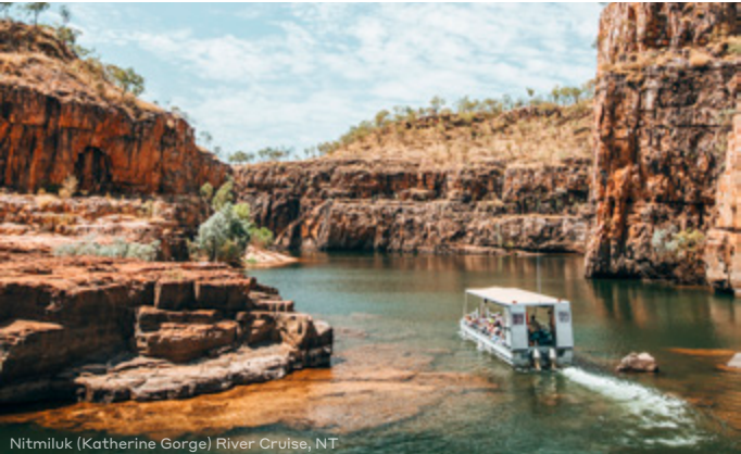
Nitmiluk (Katherine Gorge) River Cruise, NT