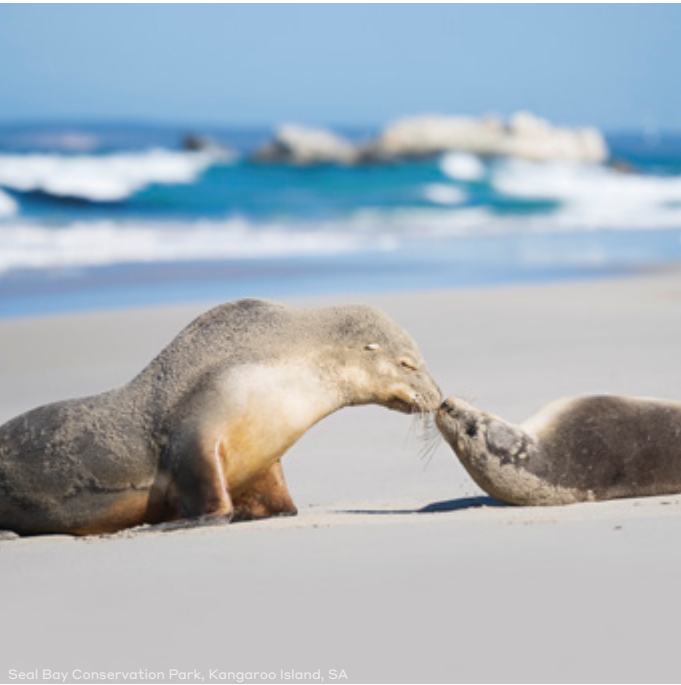
Seal Bay Conservation Park, Kangaroo Island, SA