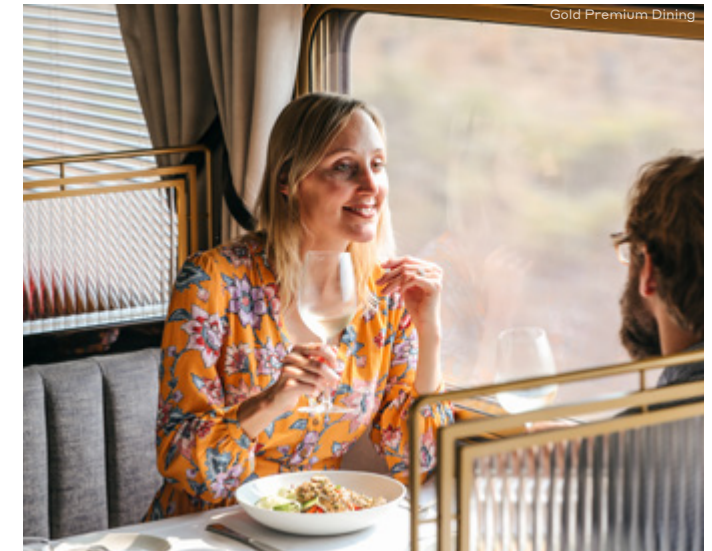
Gold Premium Dining

The Gold Premium Lounge is your social hub. It is the heart of the train. It's where you'll enjoy a morning cup of coffee, a night cap in the evening. You'll meet and mingle with fellow travellers, sharing stories and reflecting on the adventures of the day. Think luxe leather banquettes and swivel chairs made for sinking into, with mood lighting creating an elegant ambience that references the romance inherent in train travel.