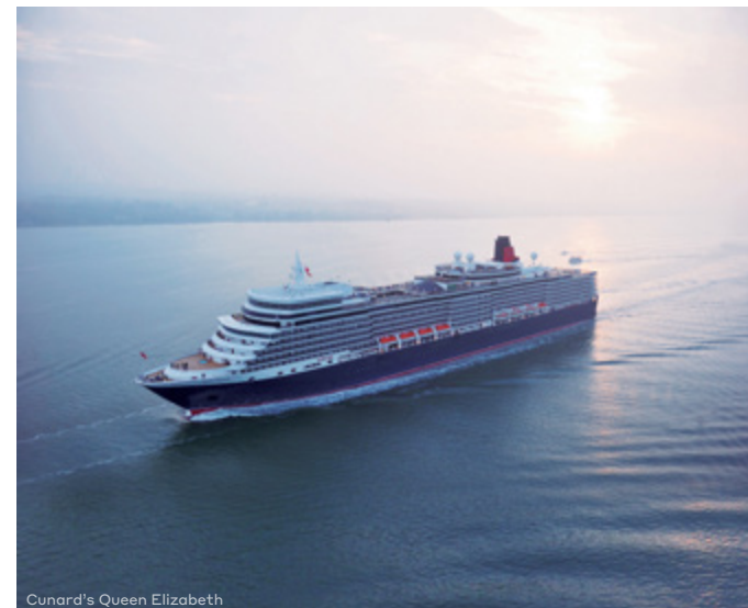
Cunard's Queen Elizabeth

On water, our cruise partners are ready to meet your every need. Sophisticated small-group cruise expedition operator Ponant is a world leader in luxury expeditions, Cunard's Queen Elizabeth evokes art deco elegance or alternatively, join Princess aboard Coral Princess®, the perfect mid-size seafarer from which to watch the coastline pass by.