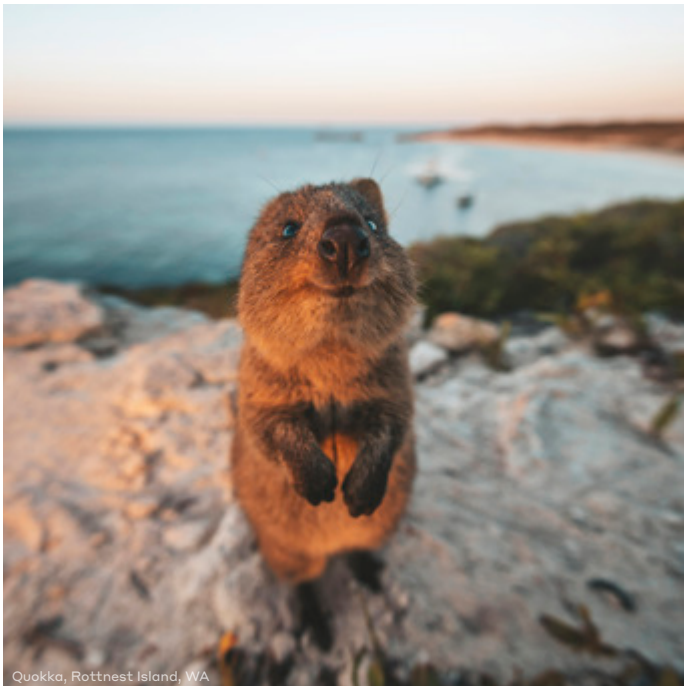
Quokka, Rottnest Island, WA