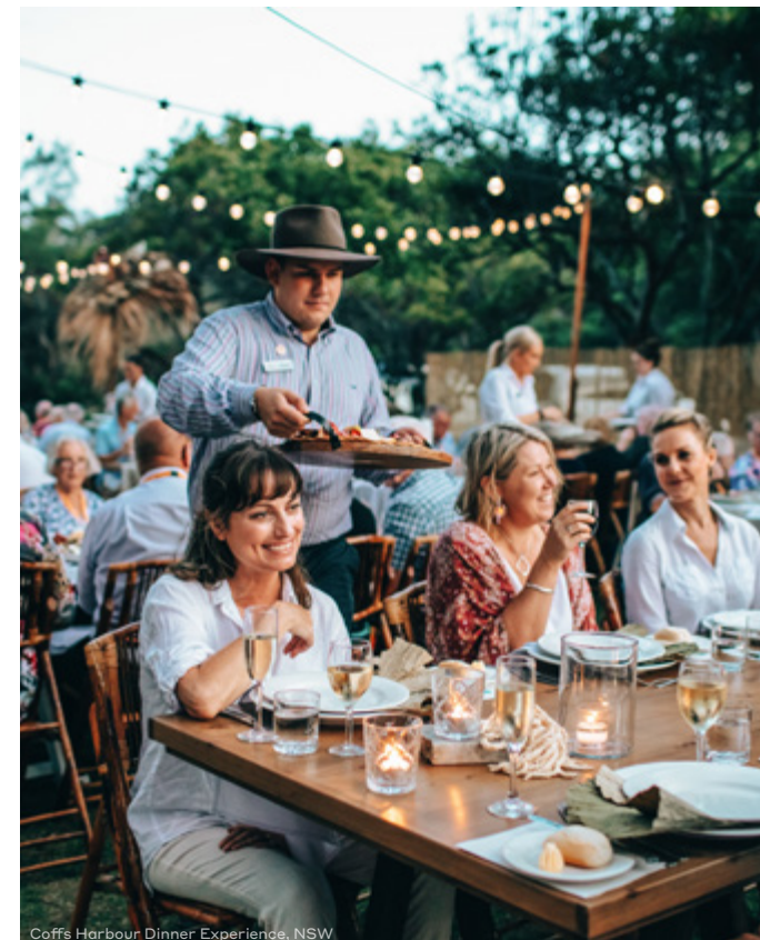
Coffs Harbour Dinner Experience, NSW

A highlight on The Ghan includes gently cruising along Nitmiluk Gorge near Katherine, witnessing the awe-inspiring sandstone cliffs and visiting an Indigenous rock art site, where artwork persists in telling its story, even after thousands of years exposed to the elements. On The Ghan Expedition, absorb the history of quirky Coober Pedy, an underground town famous for opal mining, and enjoy an evening under a blanket of stars at the Alice Springs Telegraph Station, where Akubra's and dusty red boots meet white tablecloths and silver service.