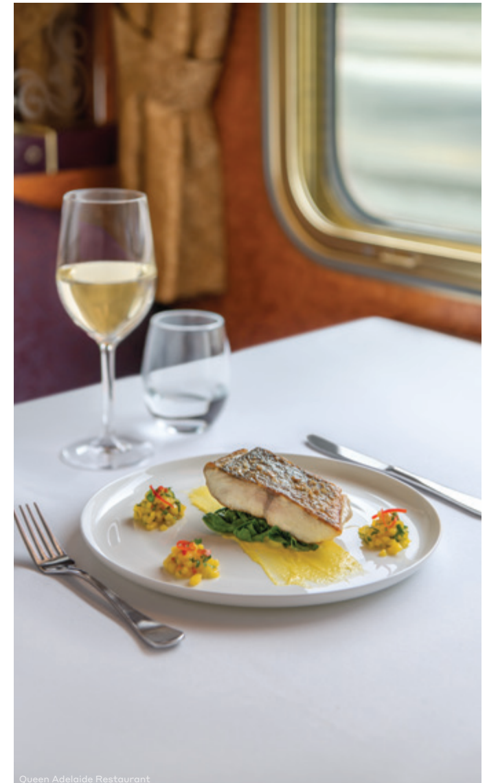
Queen Adelaide Restaurant