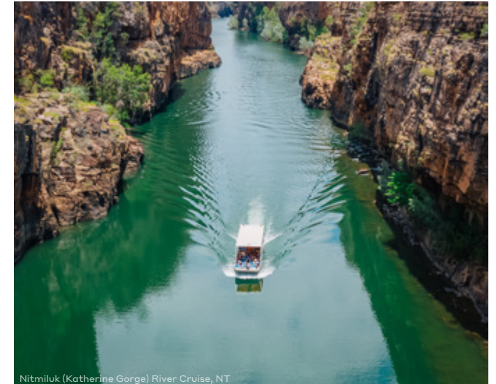
Nitmiluk (Katherine Gorge) River Cruise, NT