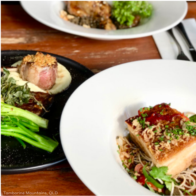
Tamborine Mountains, QLD