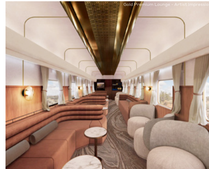
Gold Premium Lounge - Artist Impression