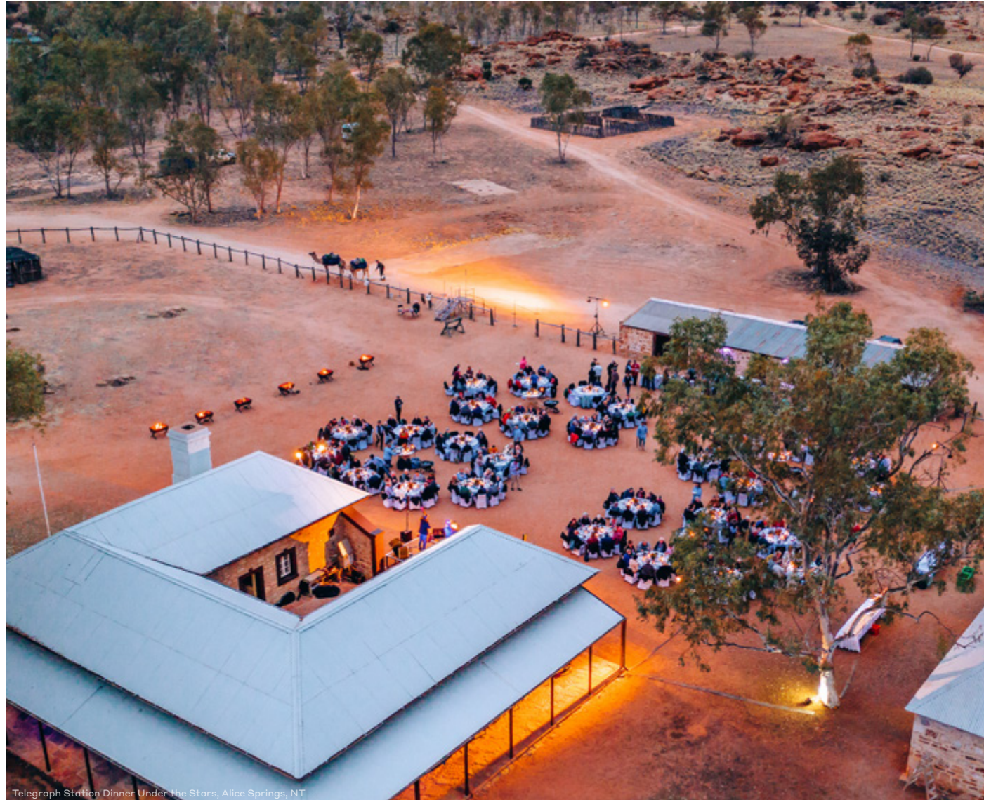
Telegraph Station Dinner Under the Stars, Alice Springs, NT