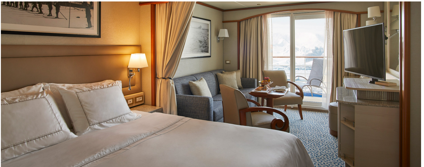
Veranda Suite & Deluxe Veranda Suite