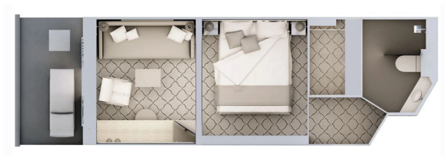
Overview : Veranda Suite & Deluxe Veranda Suite