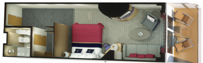
Map: Princess Grill Suite