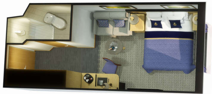
Map: Britannia Oceanview Stateroom