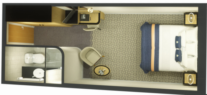
Overview: Britannia Inside Stateroom