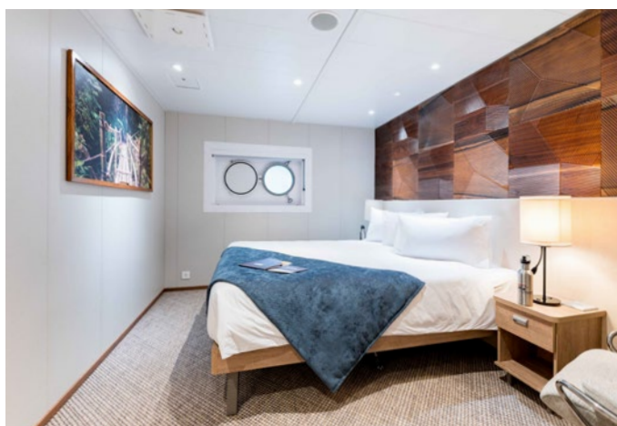
Coral Deck Stateroom