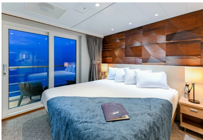
Explorer Deck Balcony Stateroom